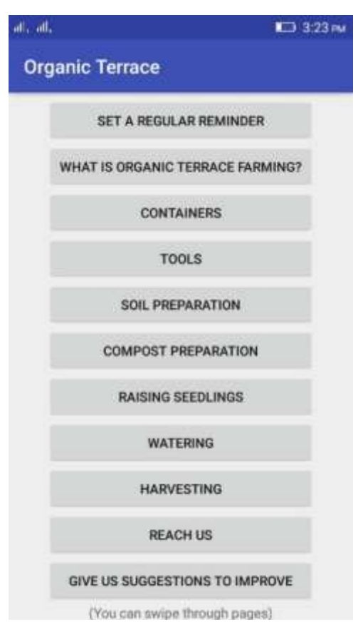
Figure 2: Main page of "Organic terrace" app