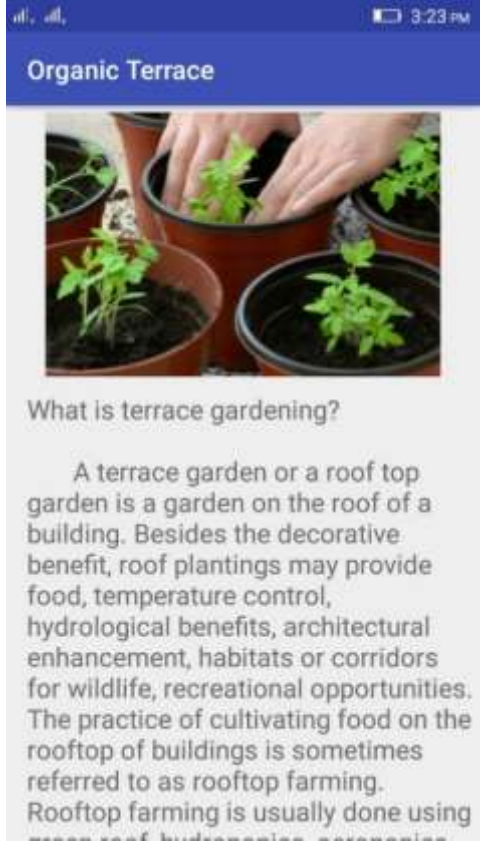
Figure 3: Introduction page of "Organic terrace" app