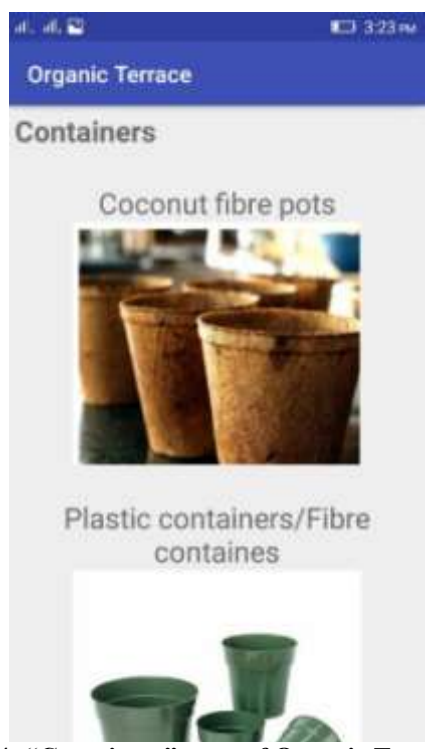
Figure 4: "Containers" page of Organic Terrace app